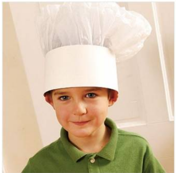
This photo originally appeared in FamilyFun Magazine

If your children like dressing up it may be good to make a homemade chefs hat like this one at The foodies