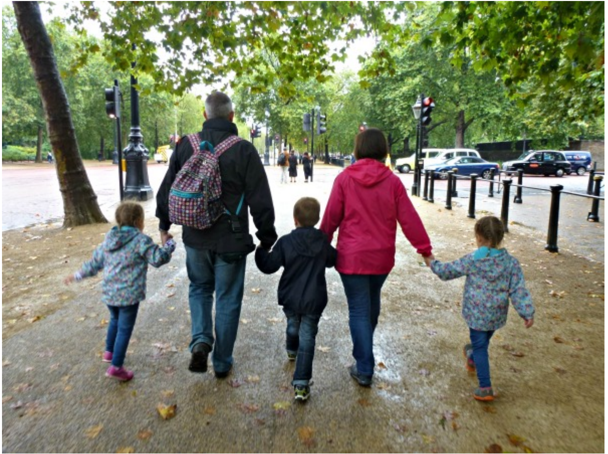
The children loved seeing Buckingham Palace and watching the guards keep still, as well as march